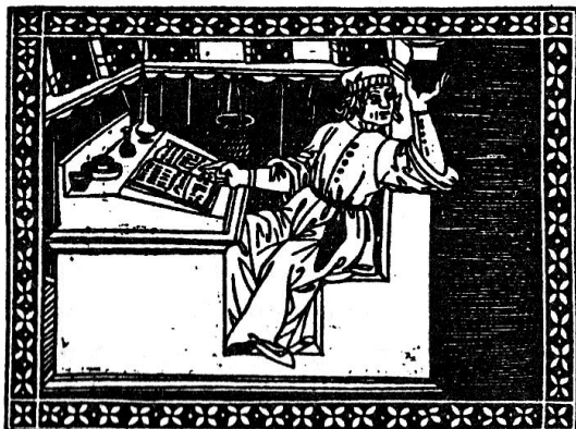
Illustration of a scribe from an Italian book of 1493; while pointing to the ms. with his right hand, he appears to be requesting more ink (or beverage?) for the container in his left.